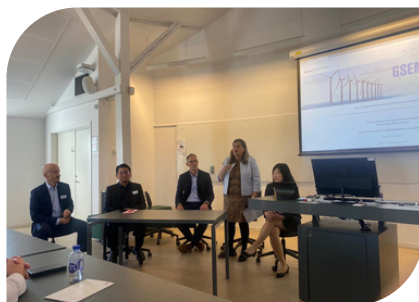
GSEM Conference In Copenhagen, October 2023