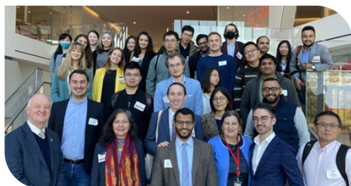
PhD research day, November 2022