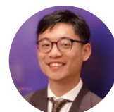
Noel Liu Case Competition Team