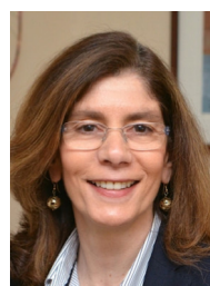
Prof. Pinelopi Koujianou Goldberg (Advisory Board Member)

Research focus: Industrial organization, applied microeconomics, applied econometrics